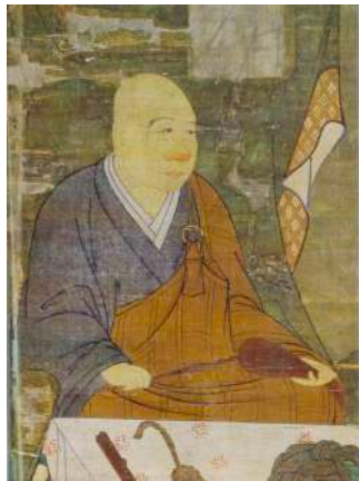
Portrait of Ninsho, exposition of the National Museum of Nara

After taking an appointment for the lecture on line, you will have at your disposal either necessary number of copies of « Textbook for Study in advance » of 8 pages about the works of Ninsho in English or the