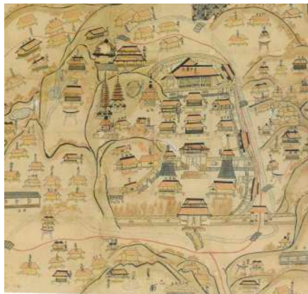
Map of Gokurakuji in the time of Ninsho, from the catalogue of the exposition of the National Museum of Nara

your presence on the spot on the day of your trip in Kamakura.